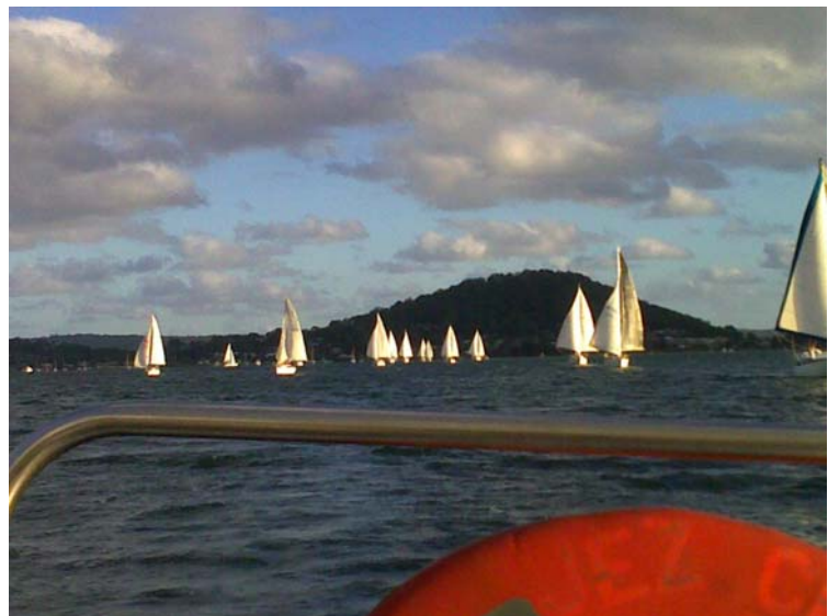
The view behind Jezebel !

(Great article Catherine – thanks for allowing us to reprint it. Ed.)